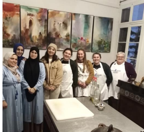
Learning about Moroccan cuisine and cooking at The Blue Door in Tangier, Morocco