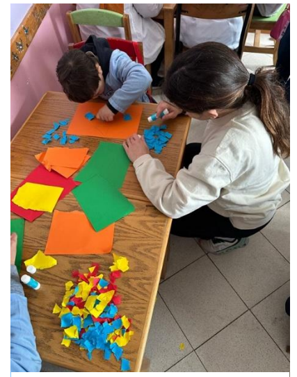
Leading Activities at a local organization in Morocco